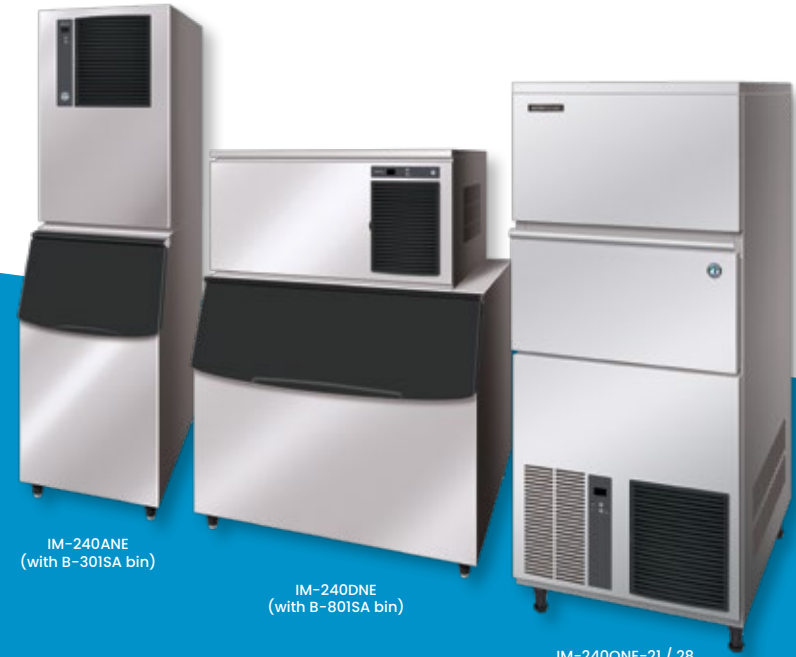
IM-240ANE (with B-30ISA bin)